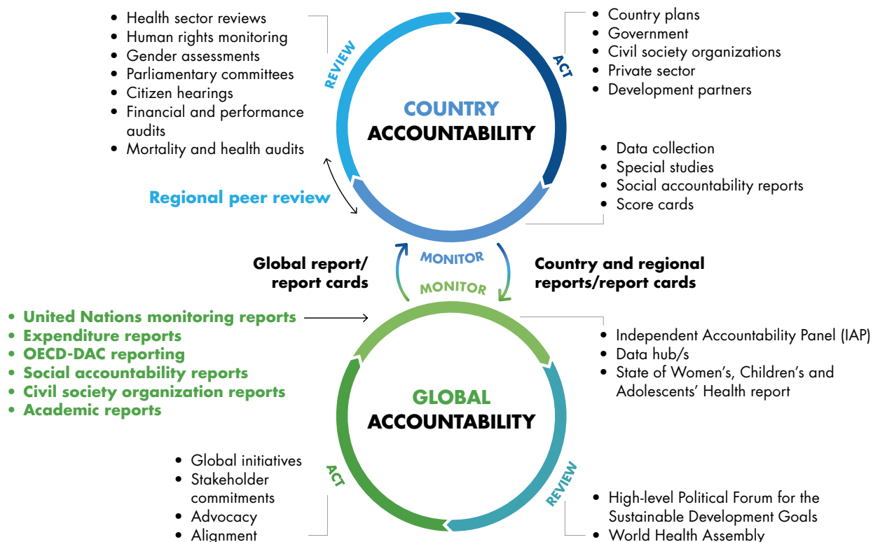
Figure 2: The Global Strategy's Unified Accountability Framework 6

The purpose of the UAF is to provide a way of organizing and bringing together diverse stakeholders and critical elements to streamline the monitor, review and act elements of accountability at all levels (Figure 2).