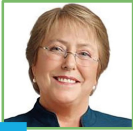
H.E. Ms. Michelle Bachelet Jeria