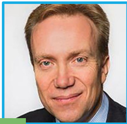
H.E. Mr. Børge Brende

H.E. Ms. Marie-Claude Bibeau is a Canadian politician and was sworn in as Minister of International Development and La Francophonie in November 2015. After earning a Bachelor's degree in Economics and a Graduate Diploma in Environmental Management from the Université de Sherbrooke, Ms. Bibeau went on to work for the Canadian International Development Agency in Canada as well as in Morocco and Benin. She eventually settled in the riding of Compton–Stanstead to raise her family, work, and volunteer in the community. Ms. Bibeau is the founder and coordinator of Regroupement des Institutions Muséales des Cantons-de-l'Est, an association of museums and former board member of several associations and organizations. She was also the Secretary of the Compton Revitalization Committee and Chair of the Governing Board of the École Louis-St-Laurent in Compton. Ms. Bibeau is an experienced business woman with co-ownership of an award winning tourism business, holding positions as Director of Accreditation for the Sherbrooke 2013 Canada Summer Games and as Executive Director of the Sherbrooke Museum of Nature and Science.