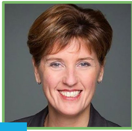
H.E. Ms. Marie-Claude Bibeau

Minister of International Development and La Francophonie of Canada