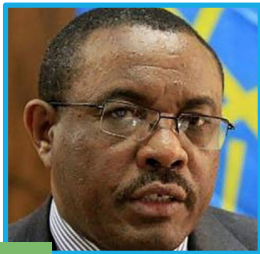
H.E. Mr. Hailemariam Desalegn

H.E. Ms. Michelle Bachelet is a Chilean politician who has served as the President of Chile since March 2014. She holds a Medical Degree with a specialization in Surgery, Paediatrics and Public Health. During the 1980's and 90s, Ms. Bachelet held several health-related positions such as with the National AIDS Commission (Conasida), the Pan-American Health Organization and the Ministry of Health, to improve primary care and service management. Ms. Bachelet became the Health Minister of Chile in 2000 and continued as the first female Defence Minister in Latin America in 2002. In 2006 Bachelet became the first female President of Chile marking a new governmental era of social inclusion and gender equality. After her first term as President in 2010 she served as president of a joint-initiative with the International Labor Organization and the World Health Organization before moving on to join UN Women as its first Director. She held this position until March 2013 when she returned to Chile to run for and take the post as President.