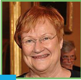
H.E. Mrs. Tarja Halonen

Former President of the Republic of Finland