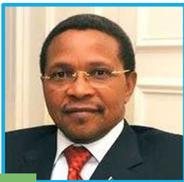
H. E. Mr. Jakaya Mrisho Kikwete

Former President of the United Republic of Tanzania